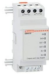
Expansion modules for modular products - inputs/outputs EXM1001